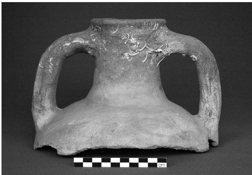
Fig 3 The amphora.

it does seem reasonable to consider it as potentially another example of east Mediterranean pottery imported to early medieval Britain.