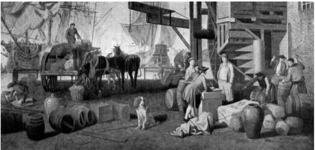
Figure 8. A detail from Samuel Scott's Old Custom House Quay or Old East India Quay of 1757. An open oil jar on the quay to the right contrasts with the closed jar to the left, which is still in its straw rope case.

a. London. Considerable fragments of a jar found on the foreshore of the Thames off Wapping [14] . This has a similar micaceous fabric and rim form to Mewstone but of greater interest is its applied plaque with the initials IF. (Fig. 7C.) This nearly complete plaque has IF